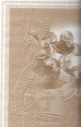
The Murder of